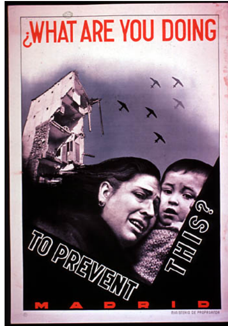
(The Popular Front of Madrid to the Popular Front of the world. Homage to the International Brigades.)