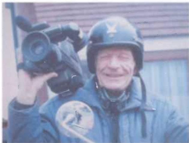
FILMING HIS BBC VIDEO DIARY "REBEL WITHOUT A PAUSE"